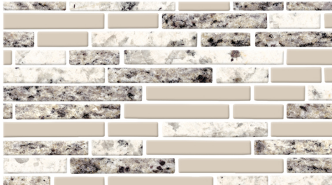
STONE CANYON, EVEREST