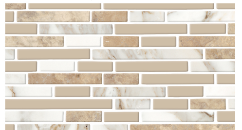
WHEAT, CALCUTTA BROWN