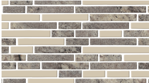
SMOKEY TOPAZ, ALMOND