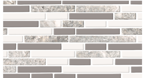
STORM, QUARRY GRAY