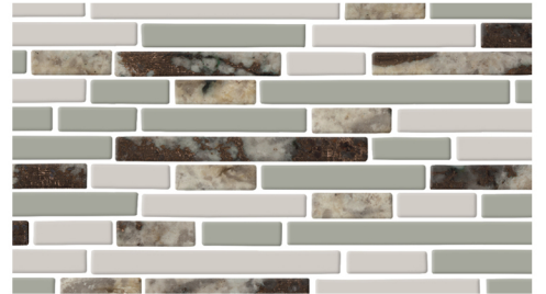
RUSTIC COPPER, SEA GLASS