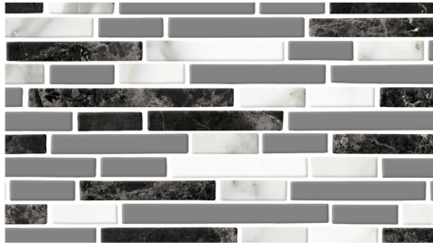
OBSIDIAN, CALCUTTA GRAY